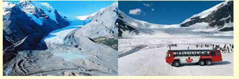
Columbia Icefield Tour and Ice Explorer Overnight stay at Rimrock Resort Hotel