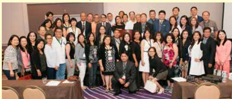
The VIP (Very Innovative Physicians) Class of 1991 during CME

The Continuing Medical Education program was pretty much borne by the Silver Jubilarian VIP (Very Innovative Physicians) Class of 1991. With a theme of “The Circle of Life”, speakers deftly struggled to maintain fifteen-minute talks that covered topics from cradle to grave. And to top it all, their feature