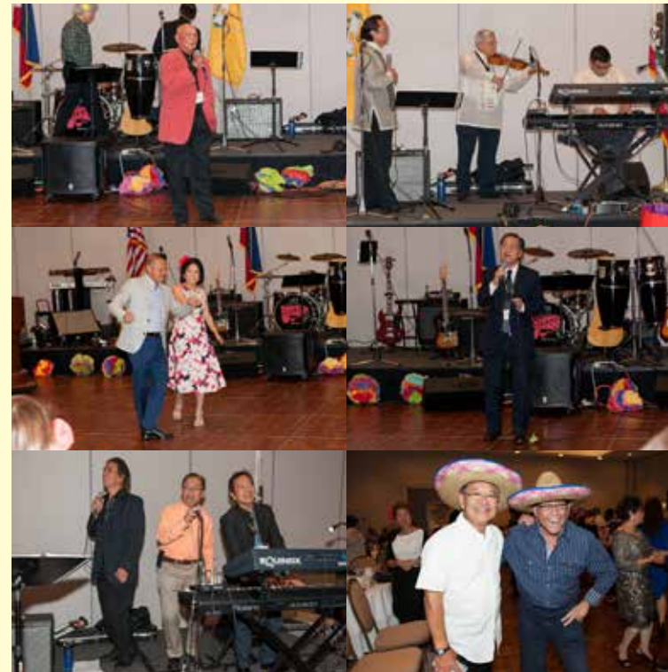
Sights &amp; Sounds of the USTMAAA Talent Night