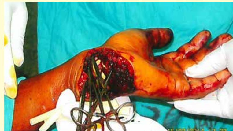
Figure 1: Lacerated wrist sustained from a machete fight

Shortly after we began unpacking, a young man was wheeled to the operating room with penetrating wounds to the left wrist as a result of a machete fight (Figure 1). Preliminary examination