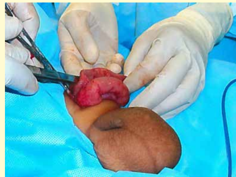
Figure 2: Large left inguinal hernia with 5 inch Ascaris inside

Several hernias of various types were repaired; none were performed laparoscopically. In one case, a sixteen month old child had a large left inguinal hernia with loops of small intestine in the sac. A five inch Ascaris worm was discovered inside the small intestine. The intestine and worm were very gently reduced back into the abdomen (Figure 2) and the hernia was repaired.