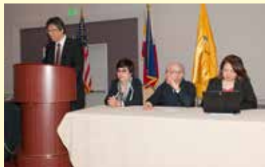
Town hall meeting w/ UST Admin