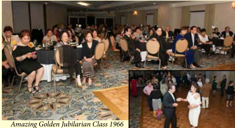
Amazing Golden Jubilarian Class 1966