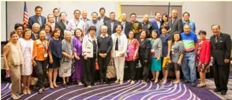
Historic hosting of USTMAAA Grand Reunion by USTMAA Southern CA

This was an historic event because Southern California had finally formally joined the USTMAAA National Organization as a chapter and no longer existed as a separate and completely independent entity. And so for the first time USTMAAA truly is the UST Medical Alumni Association of ALL of America.