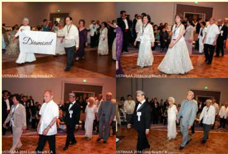
The Forever Young and Glorious Class of 1956 in the Parade of Jubilarians