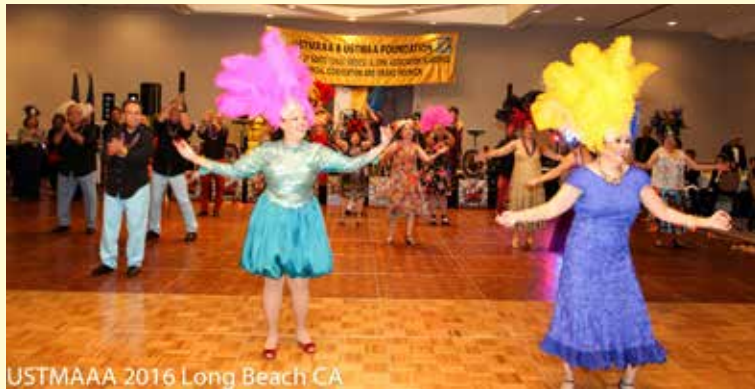
USTMAAA 2016 Long Beach CA La Creme de la Creme Sapphire Jubilarian Centennial Class of 1971

The Centennial Class of 1971, la Creme de la Creme, also enjoyed their Sapphire class reunion in the International Ballroom, relieved that they were assigned a larger venue where they could rehearse their gala dinner presentation even while sharing a heavy hors d'oeuvre. As was later seen, they really needed the larger room to accommodate the lively, boisterous and very colorful group.