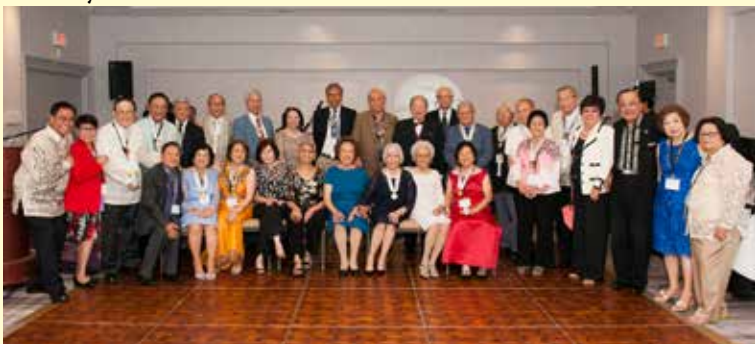
Forever Glorious and Young Diamond Jubilarian Class of 1956

Three classes held their Class Reunion in the hotel. The Forever Young and Glorious Class of 1956 celebrated its Diamond Jubilee with 29 including spouses in attendance, the largest batch of Diamond Jubilarians the USTMAAA had ever had, a feat that was just fitting for the largest class ever that graduated from UST FMS, over 600 of them. They were given their Lifetime Achievement Award complete with a commemorative USTMAAA medallion. Despite their relatively small number they had a complete 4-man band play for them as they danced the night away. They are now touting this as their best reunion ever in 60 years, which is quite a feat by itself.