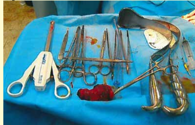
Figure 3 : Mini-cholecystectomy instrument set

Several cholecystectomies were performed, all through a 4 cm incision. Patients were released the following day. Total number of instruments in each of these "mini-cholecystectomies" was eleven and it was refreshing to revisit this surgical procedure (Figure 3).