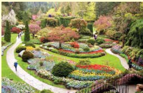
Butchart Gardens in Victoria

June 30, Friday: Boat ride to Victoria and spend the day and enjoy lunch at the beautiful Butchart Gardens surrounded by blooming flowers then tour the old city later in the day before heading back to Vancouver.