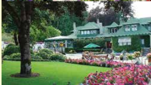
Lunch at the Butchart Gardens

July 1, Saturday: This is the official start of the Grand Reunion and Medical Convention which coincides with Canada Day which happens to be a special one, Canada's 150 th Anniversary. How lucky can we be?