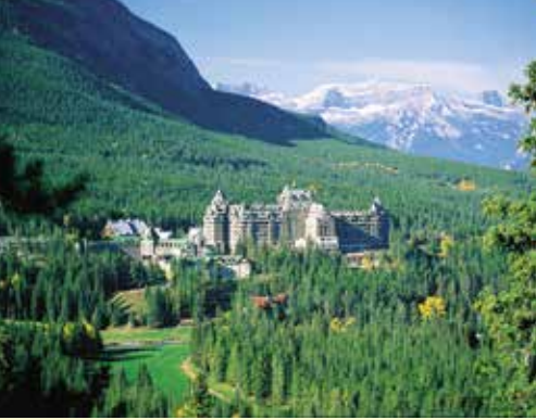
Banff Springs Four Seasons Hotel