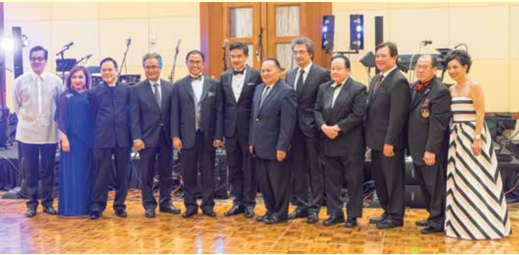
Officers and Board of Directors of the USTMAASC