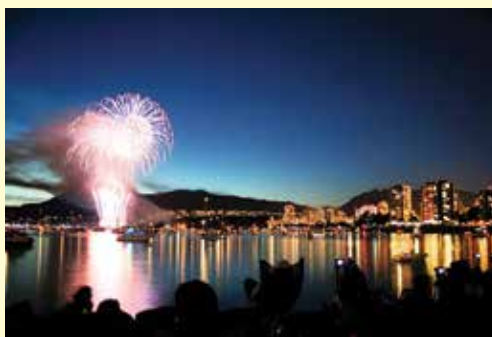
150 th Canada Day Celebration

July 1, Saturday: This is the official start of the Grand Reunion and Medical Convention which coincides with Canada Day which happens to be a special one, Canada's 150 th Anniversary. How lucky can we be?