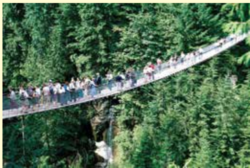
Capillano suspension bridge