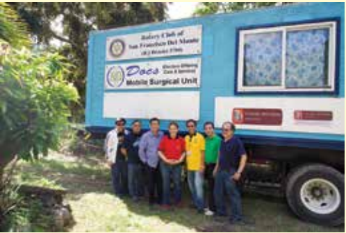
DOCS (Doctors Offering Care & Service Mobile Surgical Unit, a precursor of RP Healthcraft Carrier

Realizing the great need for this service, he had championed the construction of a mobile surgical unit under the auspices of the San Francisco del Monte Rotary Club of Quezon City, partly financed by friends, classmates, fraternity brothers, business partners and anybody else he could grab on to make the project work. And now he is embarking on a more ambitious project that will bring “the hospital” to the patients. The RP Healthcraft Carrier is such a prototype mobile hospital that