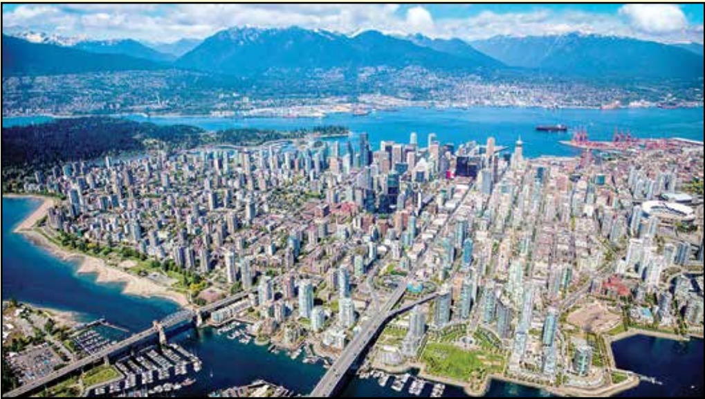
Vancouver, British Columbia, Canada, the site of the 2017 USTMAAA 25th Grand Reunion

It is never too early to prepare for the 2017 Grand Reunion. For the first time it is going to be in our northern neighbor, Canada, in the Garden City of Vancouver in the Southwestern