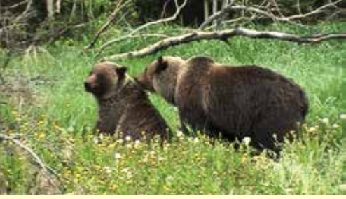
Wildlife at Jasper National Park

June 25-28, Sunday to Wednesday: Week of the convention. Bus tour of the Canadian Rockies and visit the beautiful Village of Banff and meander the Glacial Lake Louise, and my personal favorite, Moraine Lake, and even drive north to Jasper National Park and see wildlife on the roadside.