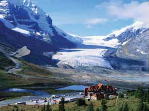
Jasper National Park

June 29, Thursday: Free day in Vancouver to enjoy its many amenities, or even take a short trip up the mountain to Whistler Ski Resort, the site of 2004 Winter Olympics.