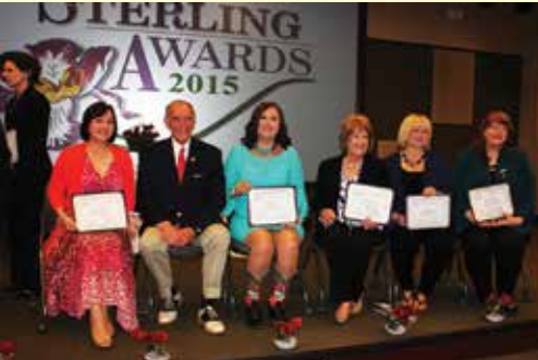
Some of the 20 Sterling Awardees