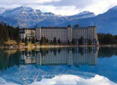
Fairmont Chateau Lake Louise