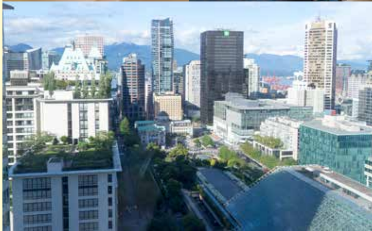
Double and King bedrooms with spectacular views of the city all around

early. There you go again, early planning and commitment is very necessary.