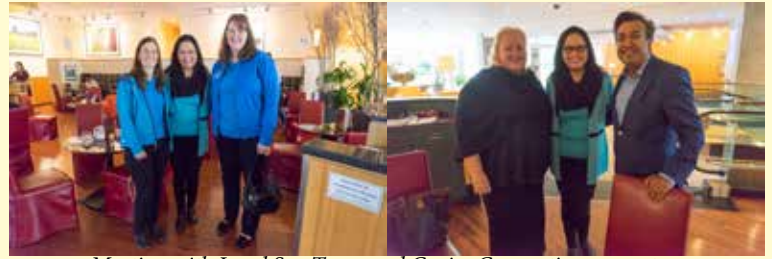
Meeting with Land Sea Tours and Cruise Connections operators

Law Offices building that was designed to look like a skyscraper that is laying on its side. Everything seemed a short 10-15 minute walk from the hotel.