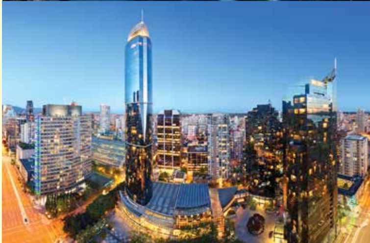
Two towers of Sheraton Wall Centre with the North Tower dominating the city

Sheraton Wall Centre is located in the middle of downtown on top of a hill overlooking the entire city.