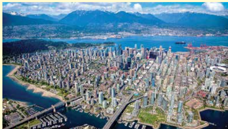
The City of Vancouver pretty much surrounded by water

With barely one year to prepare for the 25th running of the USTMAAA Grand Reunion and Medical Convention, it was deemed very important for us to take a look at the facilities of the convention venue, the Sheraton Wall Centre Hotel in