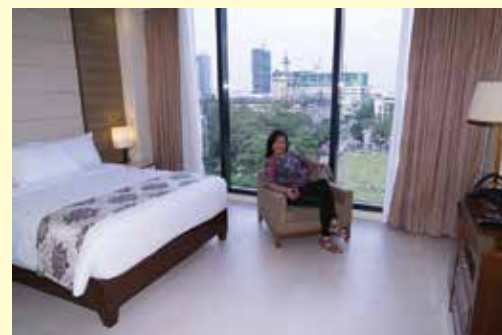
Hotel room overlooking UST campus

The rooms were very nice and comfortable and provided the usual conveniences that you would expect from a modern 3-4 star hotel in the United States. The view from the seventh floor was spectacular and overlooking most of the UST buildings including the main building and the UST Hospital beyond the expansive parade ground. Sylvia, my