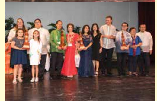
T.H.O.M.A.S. Awardees & their families

It was indeed a banner year for Class 1991 who were celebrating their 25th Anniversary from medical school with over 200 of them in attendance, perhaps the largest silver jubilarian class in attendance ever. Their cocktail reception at the Thomasian Alumni Center lobby later that afternoon at 5 PM must have been quite a party. I am sorry to say that I missed it as I had to attend another Jubilarian gathering.