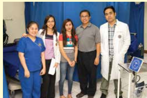
21 year old recipient of pacemaker

I had an occasion to meet a 21 year old young lady who was a recipient of a pacemaker 2 years ago and is now leading a normal life, thanks to the Save a Heart