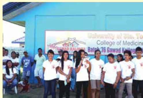
Our scholars - now college graduates and gainfully employed

Now, five years later, our class went back to visit our village again. The first batch of college scholars have already finished, are gainfully employed and able to help their families now. And from that, positive