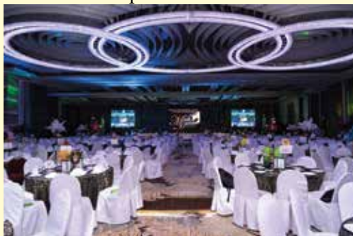
Must Dance, A Masquerade at Manila Hotel