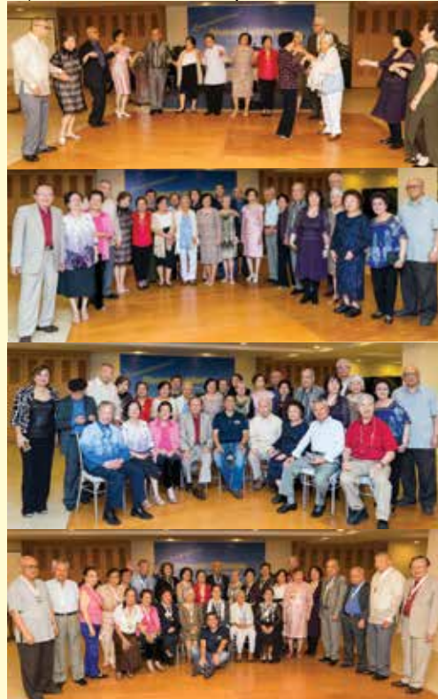
Diamond Jubilarian Class of 1956