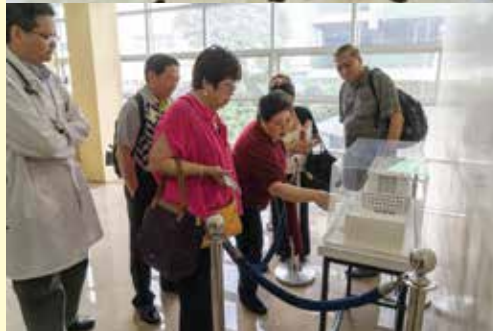
Touring the UST Hospital

quite impressed by the improvements that have been made since we had a similar tour a few years ago. The sleeping quarters for the junior and senior interns are roomier and cleaner. There are study rooms and separate dining rooms and several conference rooms and research areas. Stipends for the interns and