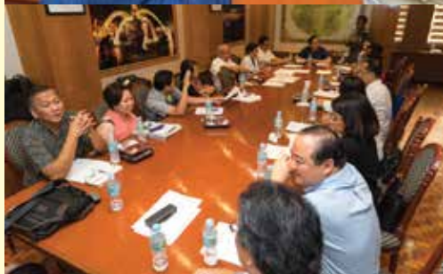
USTFMS, USTMAAI & USTMAAA Tripartite

productive because it gives us a chance to talk about common grounds and cooperate on projects that are of common interest that benefit patients, students and the Faculty, in addition to threshing out problems and try nipping them on the bud before they became too pernicious.