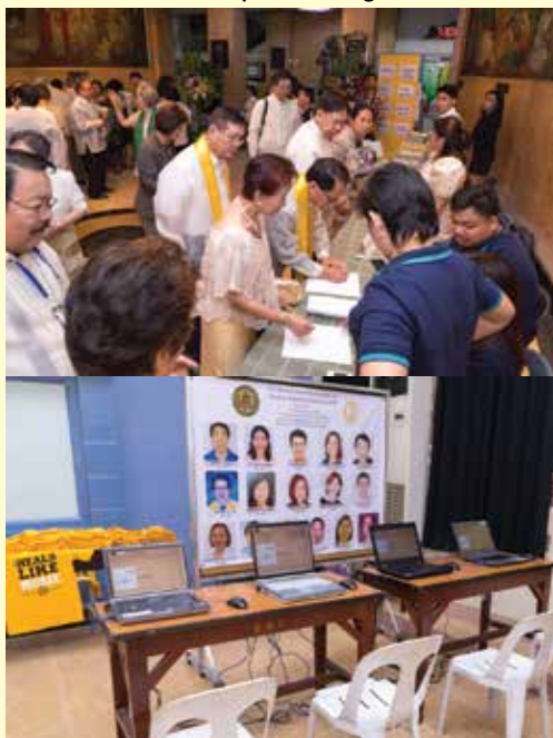
Registration and voting at USTMAA Homecoming

D ifferent this year is the Homecoming Mass and Jubilarian Awarding Ceremonies which were moved to Saturday morning from the