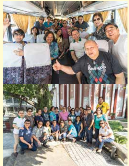
Class 1976 on their way to a medical mission