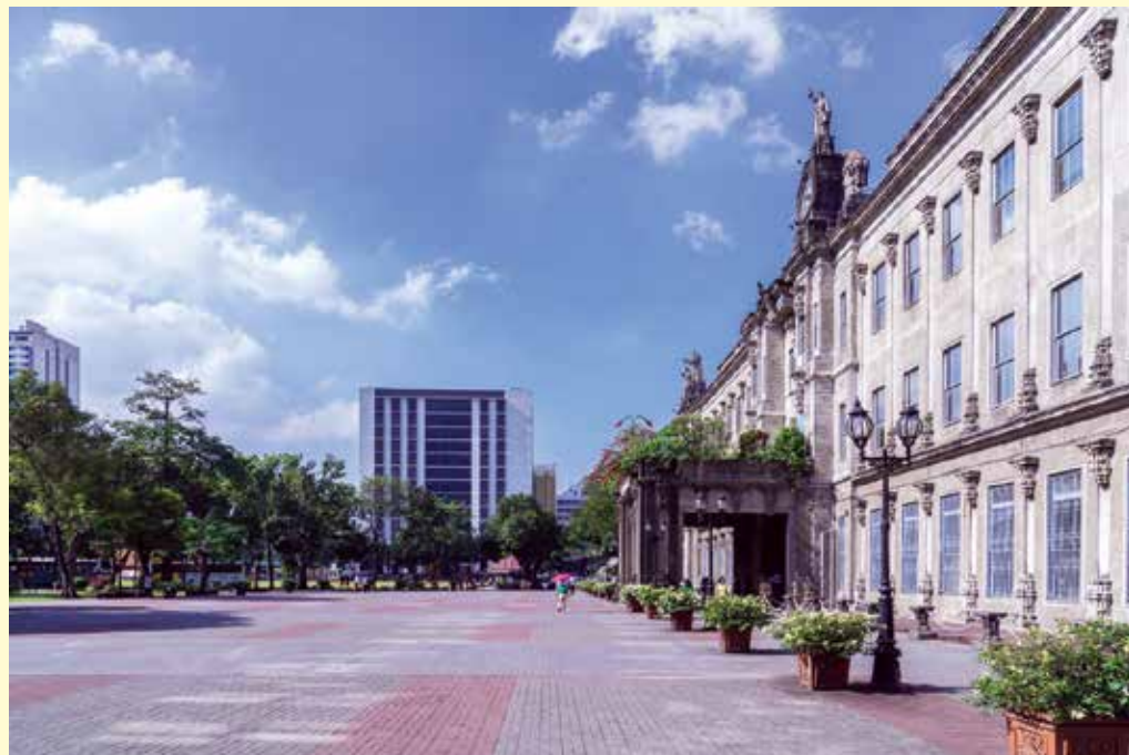
Buenaventura G. Paredes, OP-Thomasian Alumni Center building standing 12 stories tall

The Thomasian Alumni Center (TAC) occupies the first four floors and are now almost fully operational except for a few of the Alumni Association rooms still being finished. The lobby was an impressive venue for a cocktail reception and welcome ceremony. The Ballroom located in the second floor was very presentable. Catering was provided by outside services that were arranged by